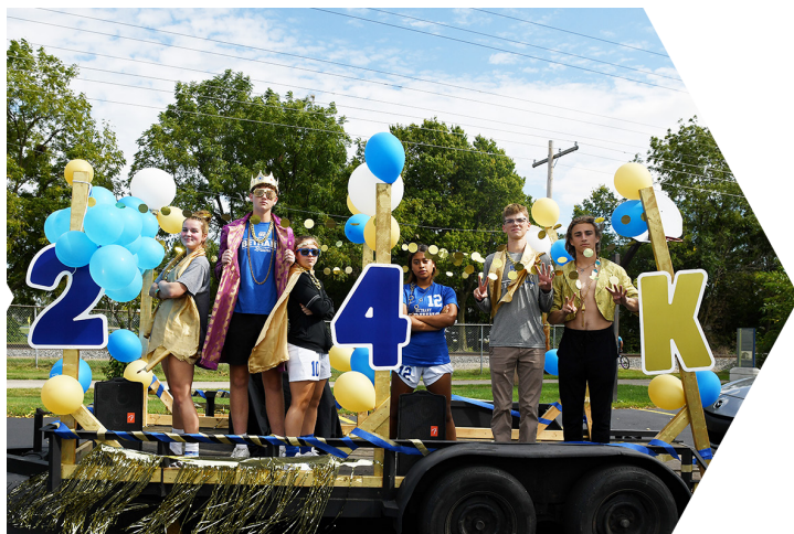
The junior class designed their float with the theme 24K gold for being the class of 2024.